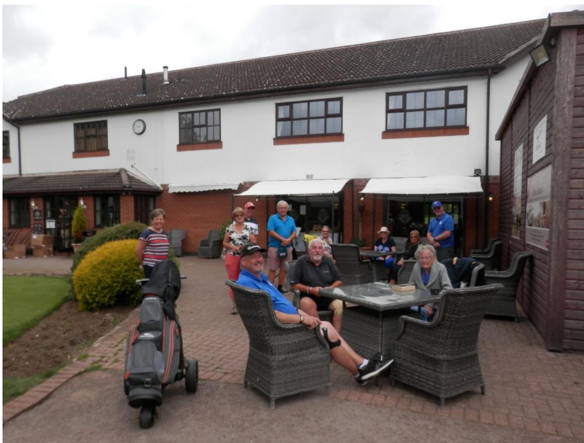
Above The Shaggies relaxing at Ullesthorpe

Everyone was pleased with the course, and indeed with the facilities. Although the spa and gym were closed. The feedback has been very positive and it looks likely that a larger group of Shaggies will be returning to Ullesthorpe on 5th July 2021.