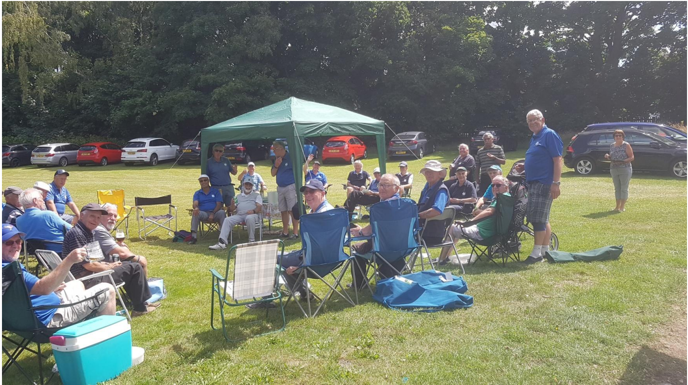
Above: The Shaggies enjoy some apres golf

The generosity of the shaggies shone through as well, and an amazing £200 was raised for the Captain's charity, The Anthony Nolan Trust.