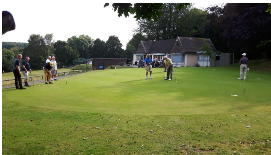
Left: The Captain's Day putting competition

day with prizes for everyone. He even claimed to have organised the excellent weather.