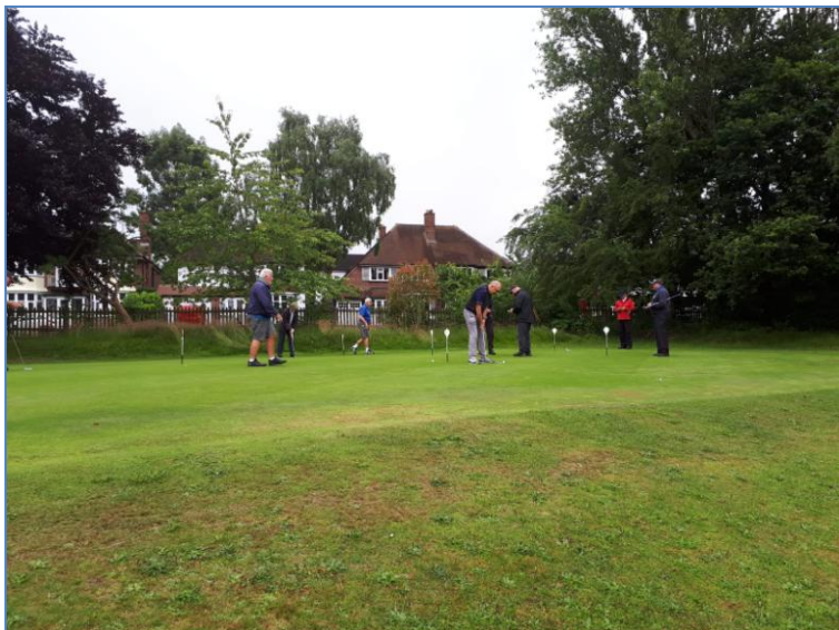
Left: The Captain's day putting competition in full swing