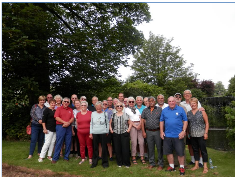
Left: The shaggies and partners at Portal Tarporley

It was also the time of the year for our stayover, this year at Portal Tarporley near Crewe.