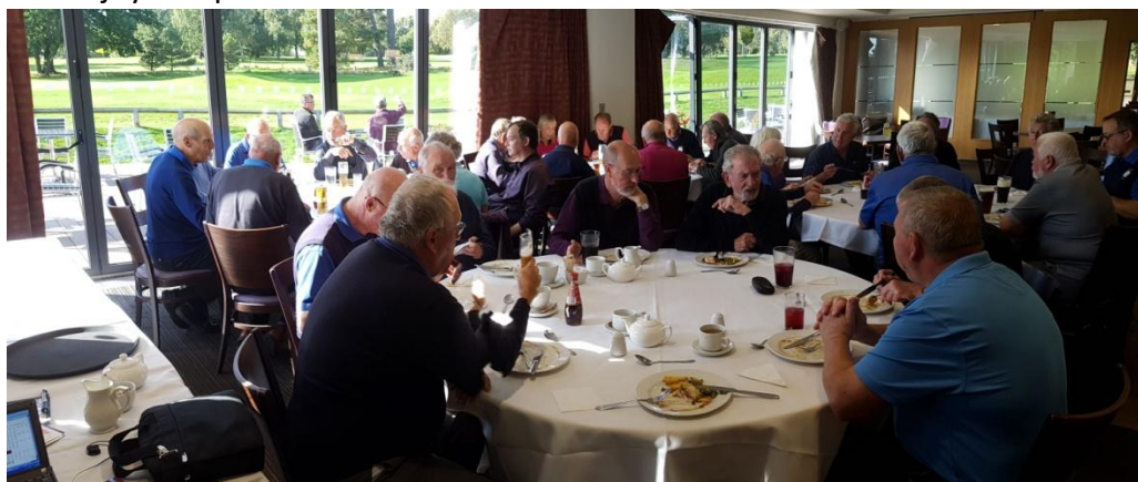
Left: our away day at Pype Hayes

Welcome to the October newsletter. The summer season is over, all our trophies have been won, our medals played and we have our annual presentation evening to look forward to in two weeks time on Thursday 17 October. It was our last away day of the year too at Pype Hayes where 33 golfers from the Shaggies and the Boldmere club played a stableford match and enjoyed a post match meal.